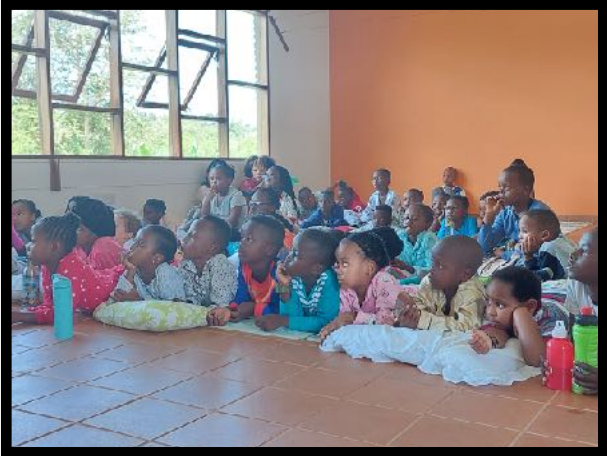
Pyjama Movie Day