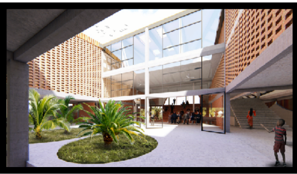
3D image from NLÉ Works