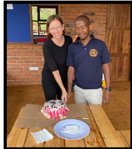
Co-Directors cutting a last minute cake in the new staff dining area

We also celebrated the 4 th Anniversary of our official opening ceremony with a last minute cake. Not quite as large of a celebration as four years ago but our staff enjoyed the cake.