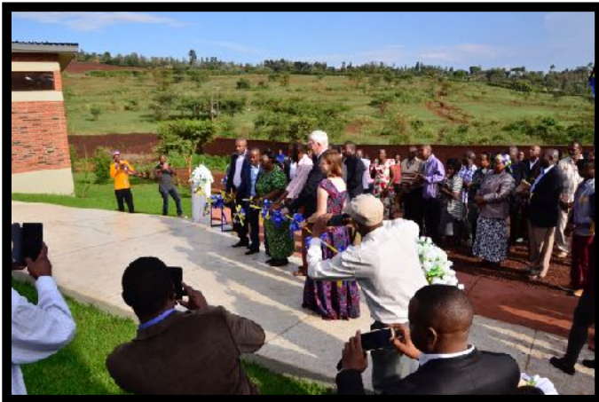
Official Ribbon Cutting in January 2018