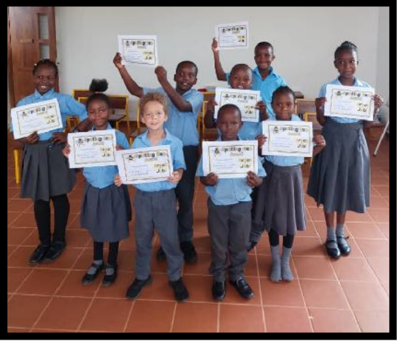
Monthly Certificate Assembly