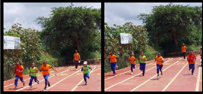
Black Rhino Sports Day