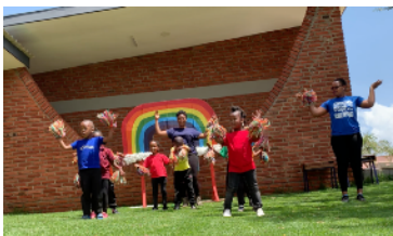
Reception and Year 1

We had our annual book week at school in March 2021 with each class performing a skit or song related to stories and topics they studied that week.