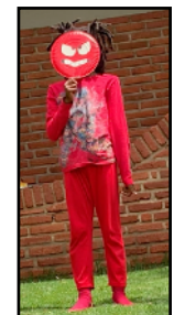
Year 3 Performing a skit about emotions: disgust, happiness, sadness, fear, and anger