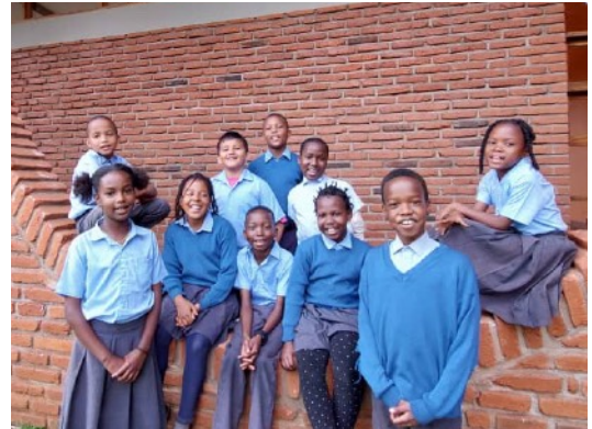
Black Rhino's first student council