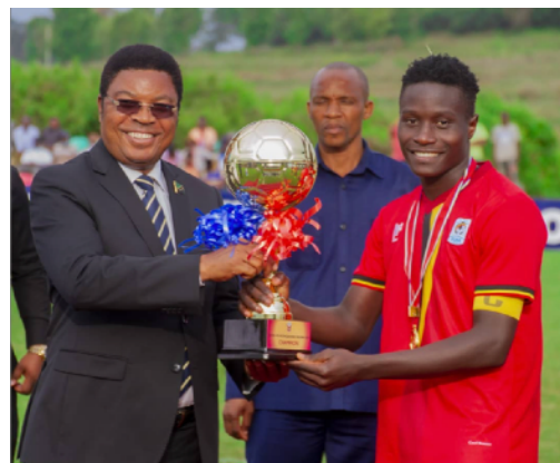
Tanzanian Prime Minister Kassim Majaliwa with the Captain of the Ugandan team